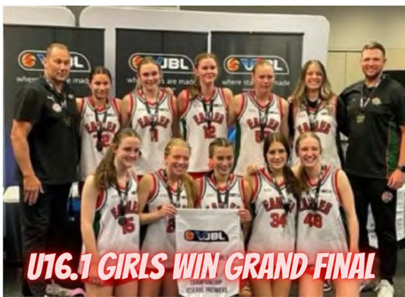
U16.1 GIRLS WIN GRAND FINAL