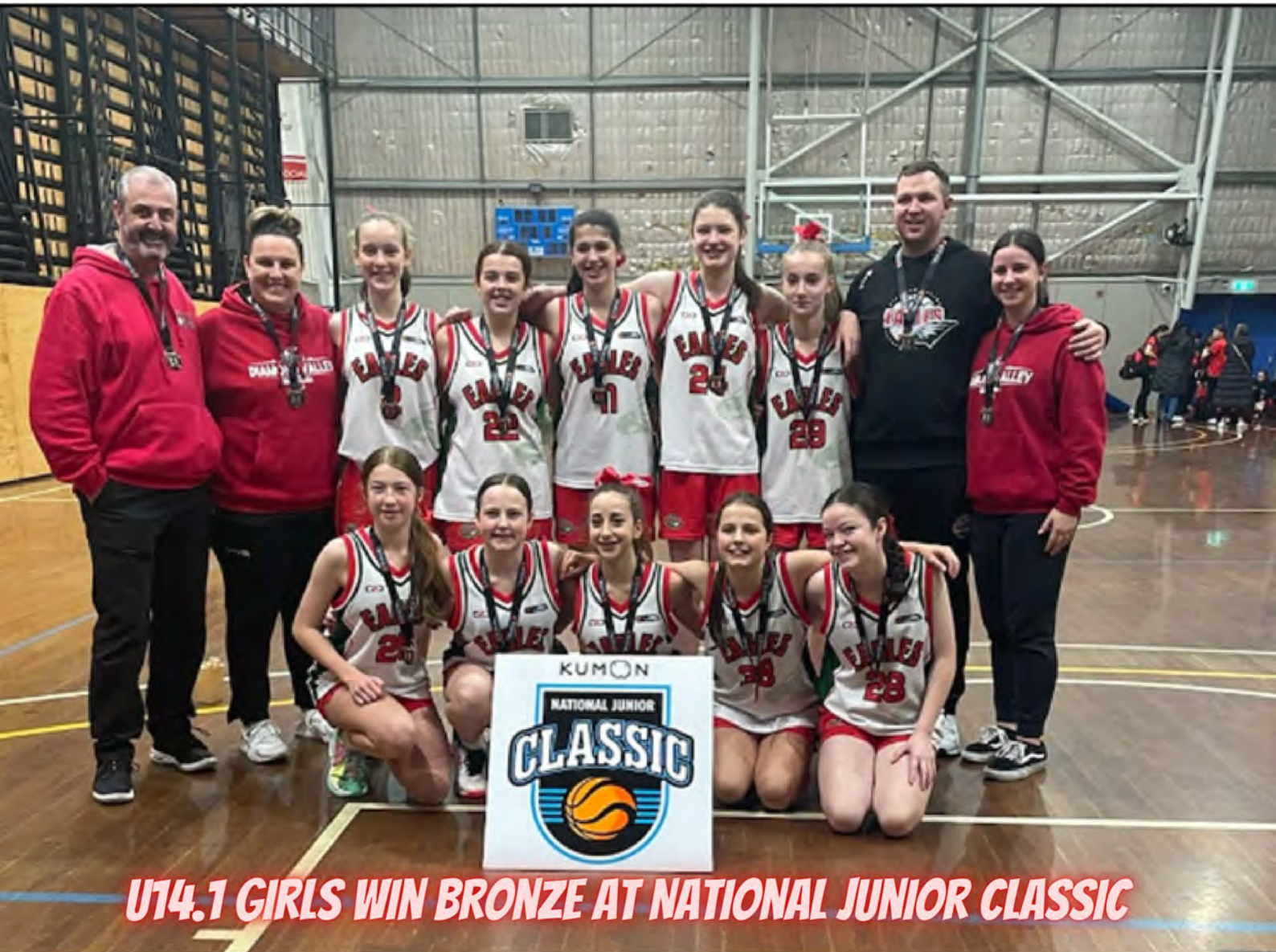
U14.1 GIRLS WIN BRONZE AT NATIONAL JUNIOR CLASSIC

HIGHLIGHTS AND GREAT ACHIEVEMENTS FOR 2022