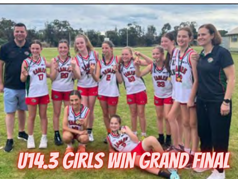
U14.3 GIRLS WIN GRAND FINAL